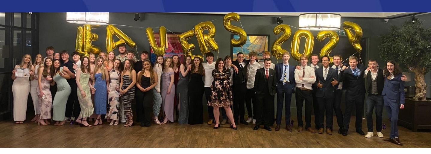
BEST OF LUCK... to all Year 13s who finished their exams this June and can be seen above at their Year 13 Prom at the Royal Norwich Golf Club on Friday 27 June. We wish them all the best of luck in their results and in their next steps after Sixth Form.